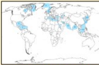
The World's largest seas