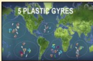
Ocean garbage patches