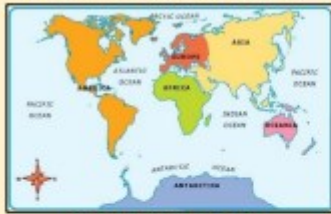
The World's Oceans