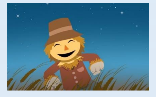
Dingle Dangle Scarecrow

These are the songs we have been enjoying in school. Please click on the links below to go to a YouTube version. You might also find your own alternative versions which the children will love to sing with you.