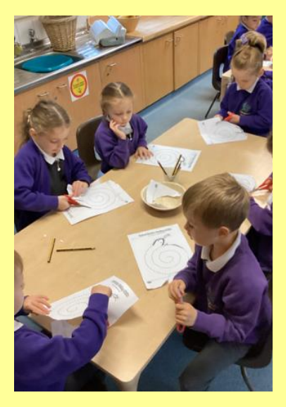
Cutting sssss snakes!