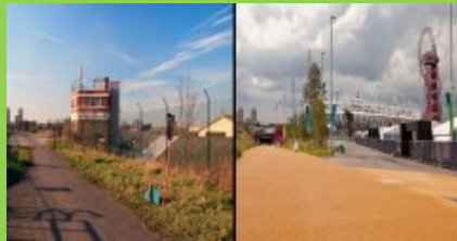
Olympic stadium and park, London - before and after development