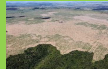
Deforestation in Maranhao, Brazil