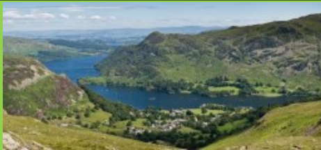
Glenridding in Cumbria