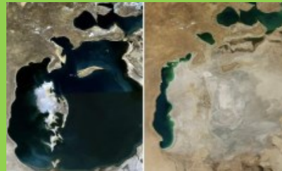
Aral sea - before and after water extraction for irrigation