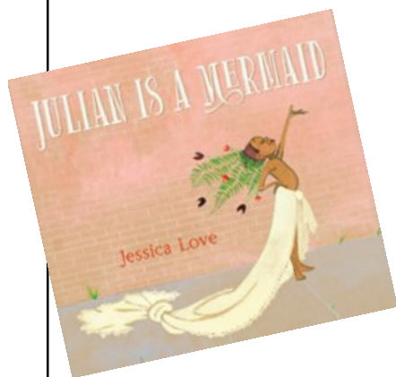
KS1: Julian is a Mermaid by Jessica Love

KS2: Royal Rabbits of London: The Hunt for the Golden Carrot by Santa Montefiore