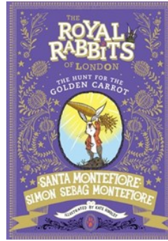
Royal Rabbits of London: The Hunt for the Golden Carrot by Santa Montefiore