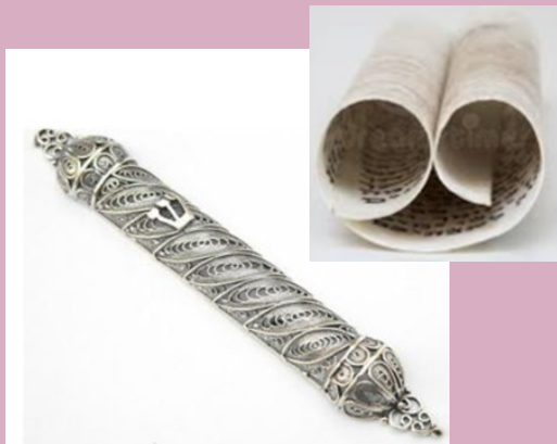
Mezuzah/ Shema scroll