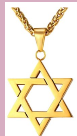
Star of David