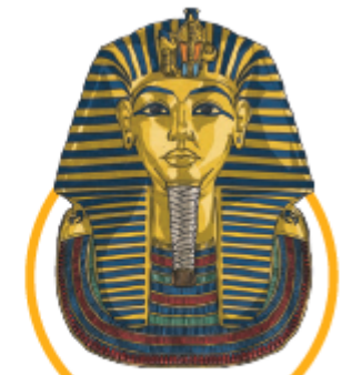
Tutankhamun's death mask