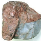
obsidian granite basalt

Far underground, the temperature is so hot, rock melts into a liquid (molten rock). When the liquid is underground it is called 'magma' and it can cool to form an intrusive rock. When it spills out (volcano), the liquid is called 'lava' and it cools to form extrusive rock.