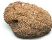
limestone chalk sandstone

These rocks form under the sea. Rocks are broken into small pieces by wind/water (erosion). They settle as mud, sand, minerals and even remains of living things. Over time, layers pile up and the pressure turns this sediment into rock.